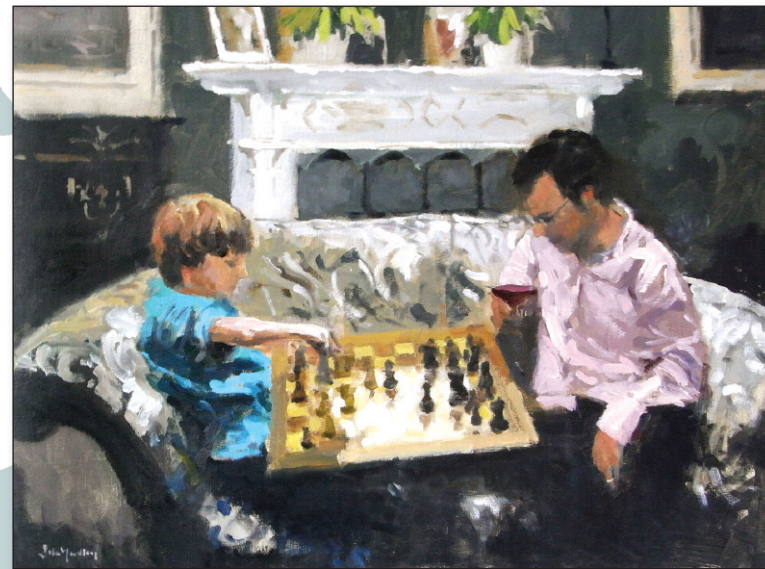
[Oil] Nephew versus Uncle, 18" x 24"